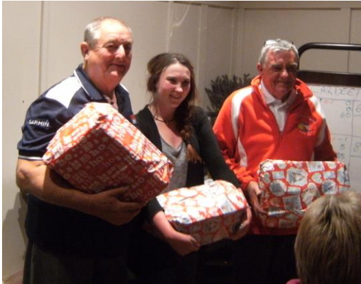
Team Bobnalong with their prizes