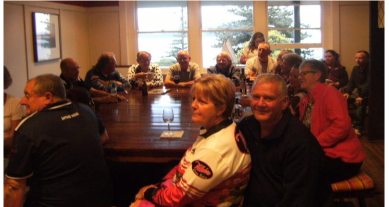
Watching the scoring from the big table

Once again a great weekend was had by all, the worst part being, it just was not long enough !!