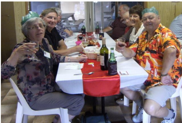
One group getting into the Xmas spirit.

The Christmas Party : On a lovely summer evening a good crowd of 69 gathered at the clubhouse for a dress rehearsal for the real event, now only a couple of weeks away. The sound of merriment