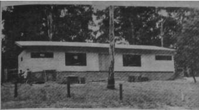
Pictured is the new Eden Amateur Fishing Club building, which is nearly completed after a three-day non-stop building effort over the Australia Day long week-end.

From the Imlay Magnet – January 29, 1987