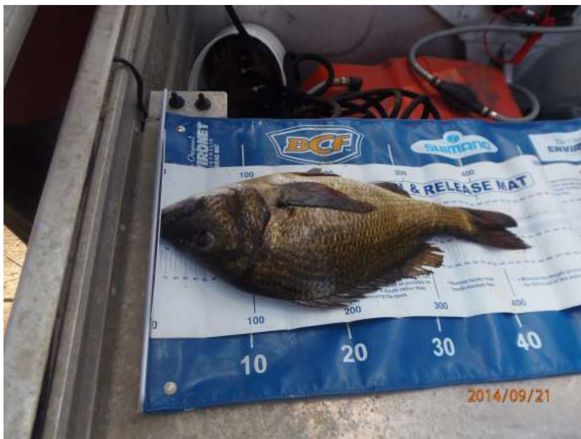
Wayne Welch's entry in the Bream Catch and Release. The fish is around 450mm in length (unofficial editors reading)

Large Bream are magnificent looking creatures and many anglers, including myself, prefer to release them. This competition will allow anglers to do that and still have their achievement recognized. No other competition is changed in any way so this one will not impact at all on those who wish to keep their catch. The club does encourage sustainable fishing practices, including catch and release, and it's to be hoped that this competition is embraced in the intended spirit and all fish entered are released unharmed.