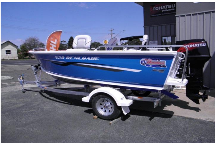
Lucky draw prize 2016 competition

Enjoy your fishing and see you at the Festival ?